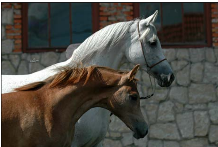
Pustynna Róża (Emigrant - Pustynna Tarcza / Pamir) with her 2006 filly Pustynna Gala by Galba.