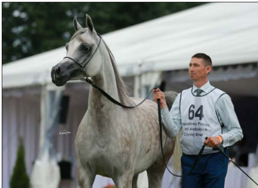
Zigi Zara (Shanghai EA - Zigi Zana / QR Marc)

Reserve Champion Junior Filly, 2010 Polish National Champion Junior Filly as well as 2010 and 2011 European Reserve Champion Junior Filly. As Polish mares mature like fine wine, she continued her show career as a senior contender, winning the titles of 2013 Polish National Reserve Champion, Gold Champion and Best in Show Female of the 2023 All Polish Arabian Horse Championship as well as 2023 Polish National Bronze Champion Senior Mare. ZIGI ZANA's best produce to date include 2019 Polish National Bronze Champion Senior Mare ZIGI ZARA 2015 (by Shanghai EA) and the 2022 bay colt ZIGI ZAHN (by AJ Azzam), who reached for gold at the 2023 All Polish Arabian Horse Championship, the same show at which his dam was crowned Gold Champion and Best in Show Female. In 2005, after ZAGROBLA returned from her overseas travels, she gave birth to a grey colt ZIGI-ZAN (by Padrons Psyche), who grew into a