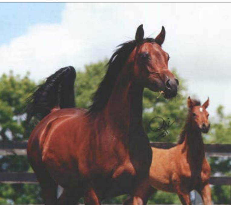
Albula (Fawor - Algeria / Celebes) Gigi Grasso