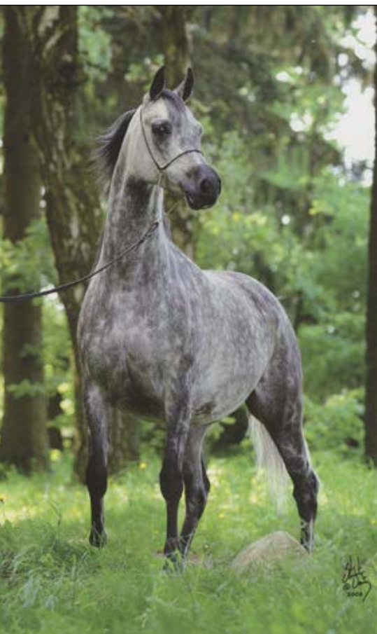
Amra (Eukaliptus - Albigowa / Fawor) Stuart Vesty