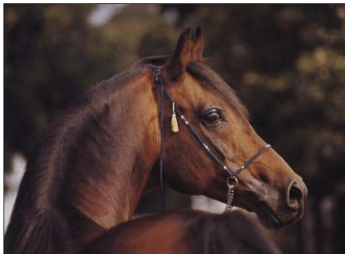
Algomej (Celebes - Algonkina / Pietuszok) Gabrielle Boisselle