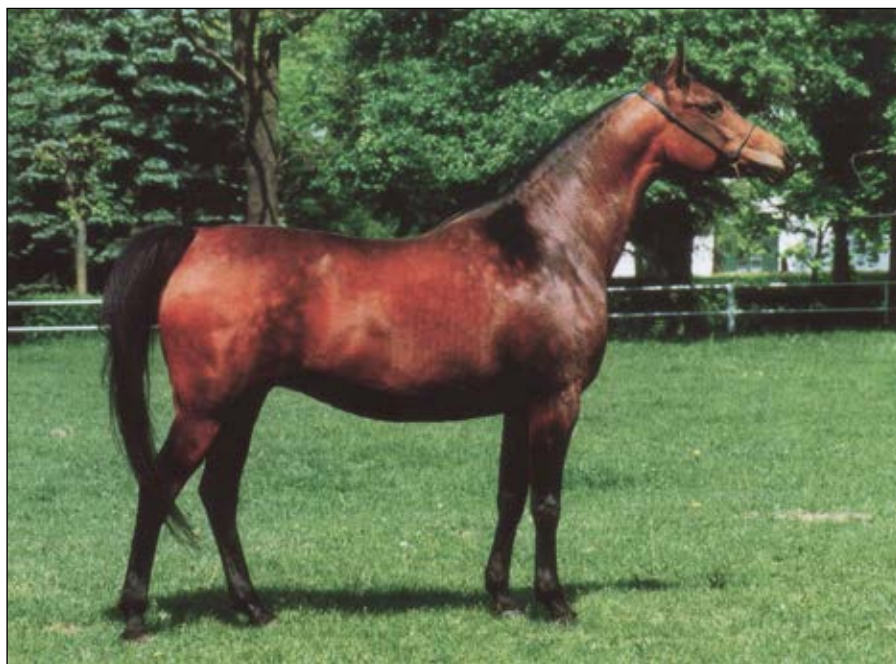
Albigowa (Fawor - Algeria / Celebes)