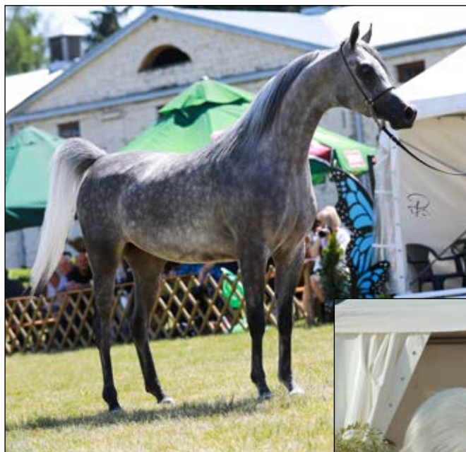
Atakama (Empire - Atma / Ekstern) Paola Drera