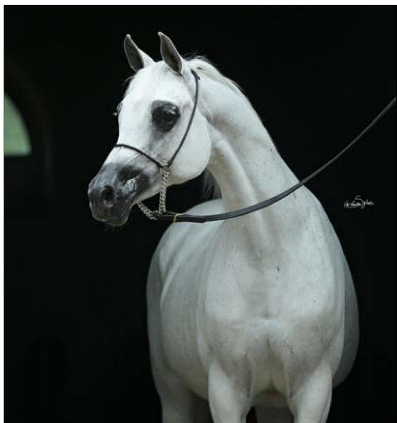
Amiga (Piaff - Amra / Eukaliptus) Sylwia Itenda