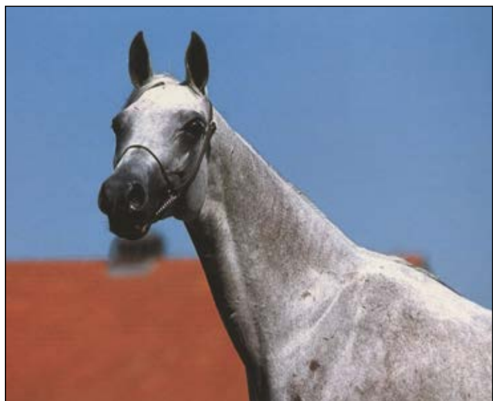
Zguba (Enrilo - Zazula / Negatiw) Stuart Vesty