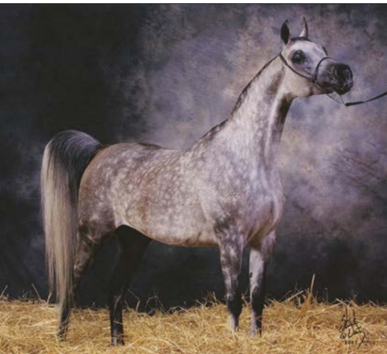
Altona (Eukaliptus - Albigowa / Fawor) Stuart Vesty