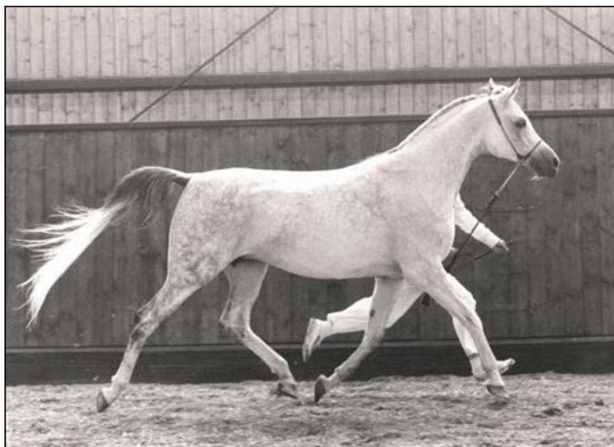
Zazula (Negativ - Złota Iwa / Arax)