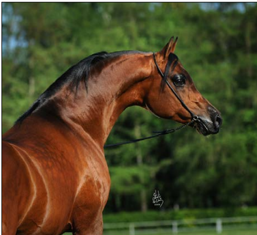
Aslan (Eukaliptus - Algora / Probat) Stuart Vesty