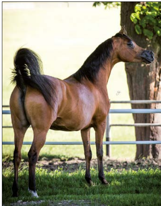
Zazulka (Ekstern - Zuzelia / Werbum) Glenn Jacobs