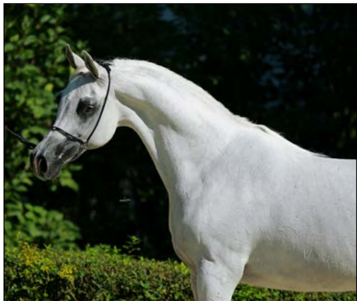
Zagrobla (Monogramm - Zguba / Enrilo) Sylwia Itenda