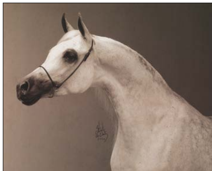
Palestyna (Monogramm - Palestra / Penitent) Stuart Vesty