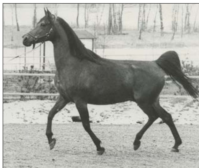
Borexja (Exelsjor - Bogoria / Laur)