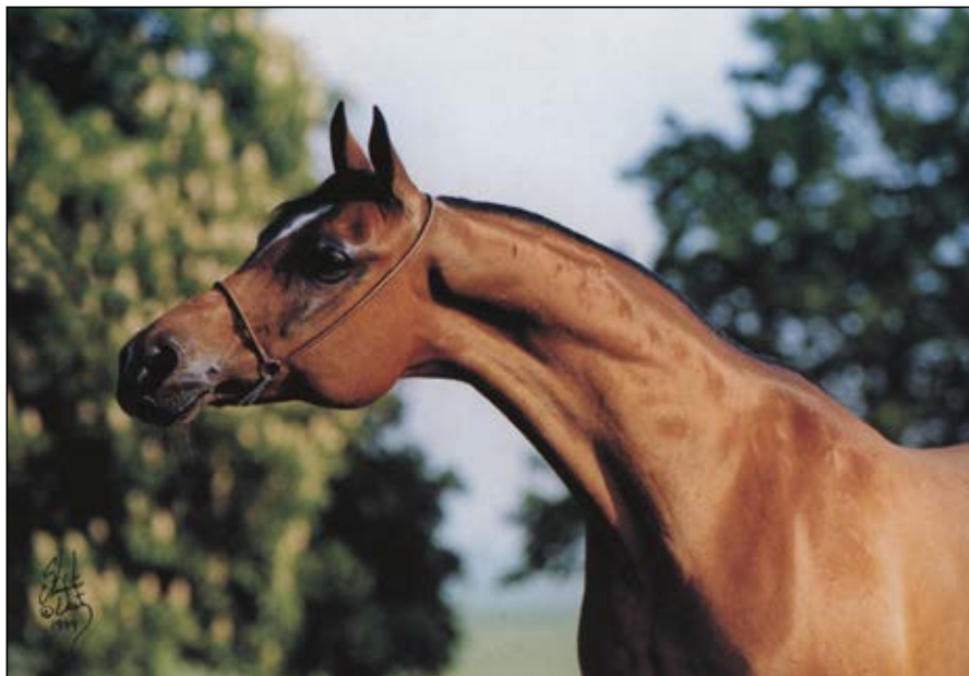
Zula (Probat - Zazula / Negatiw) Stuart Vesty

half-brother to the Michałów most celebrated broodmatron EMIGRACJA 1980 (by Palas). With PROBAT, ZAZULA produced two fillies, the 1981 bay ZULA and 1982 chestnut ZUELA. ZUELA's heritage at Michałów was continued by the grey ZENOBIA 1988 (by Endel), the only filly she left in Poland before being