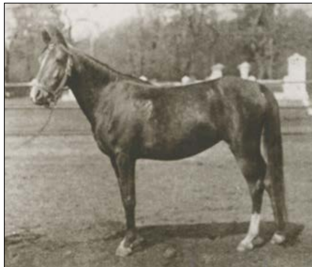
Sardhana (Nureddin II - Selima / Astraled)