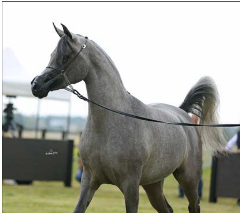
Platyna NA (Shanghai EA - Pantera / Ekstern) Sylwia Itenda