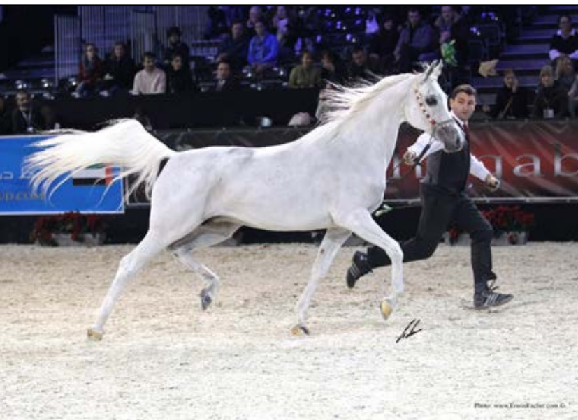
Zagrobla (Monogramm - Zguba / Enrilo) Erwin Escher