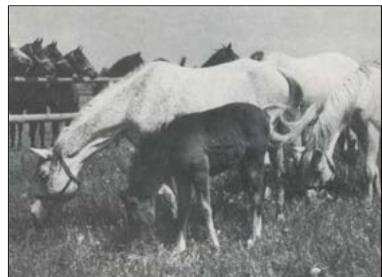
Bulwa (Kuhailan Zaid DB - 12 Siglavy Bagdady / Siglavy Bagdady DB) with her daughter Bulgotka by Witraż

great-granddaughter BULWA 1937 (Kuhailan Zaid DB – 12 Siglavy Bagdady / Siglavy Bagdady DB) was imported to Poland in 1946 with other Babolna-bred mares who arrived to Polish state studs mingled among the Polish Arabians reclaimed from Germany shortly after the end of World War II. Before she returned to Hungary in 1951 where she was put to death in 1957, BULWA produced three full siblings by the epochal stallion WITRAŻ 1938 (Ofir – Makata / Fetysz), two fillies and one colt.