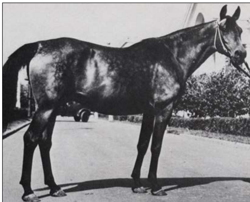
Taktika (Taki Pan - Krona / Kann)

Senior Stallion and the star of the 2013 Swedish Nationals with the titles of Gold Champion Senior Stallion, Liberty Champion and Best in Show. A few years later, ZIGI-ZAN won the titles of 2015 Nordic Open Silver Champion Senior Stallion as well as 2015