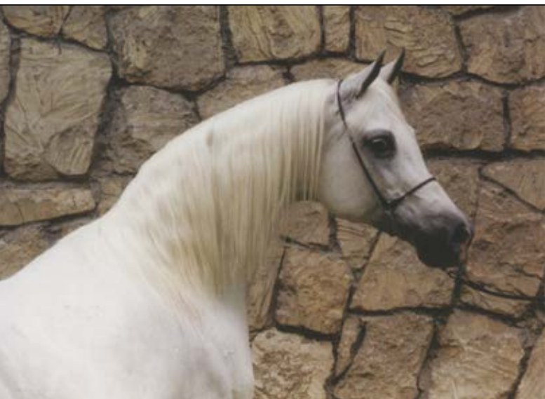
Palestra (Penitent - Patera / Bandos) Stuart Vesty