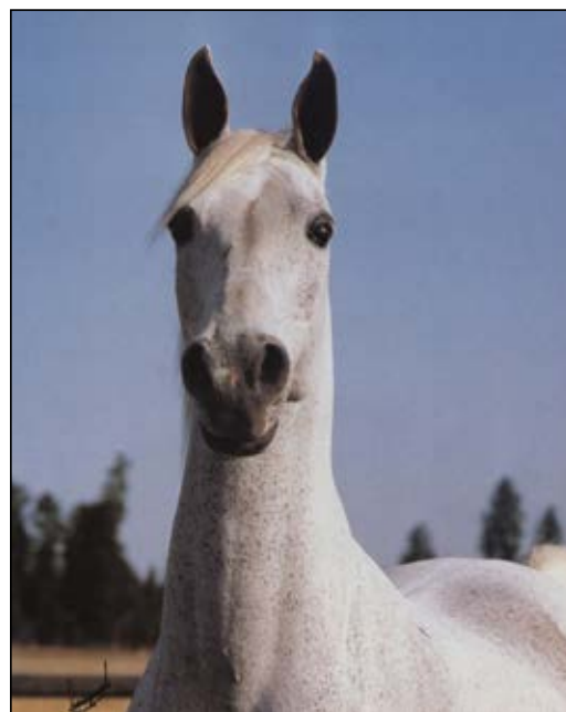
Podwika (Comet - Potencja / Priboj) Jerry Sparagowski