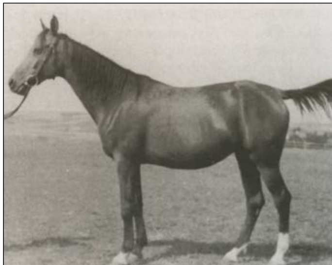
Rasima (Rasim Pierwszy - Sardhana / Nureddin II)