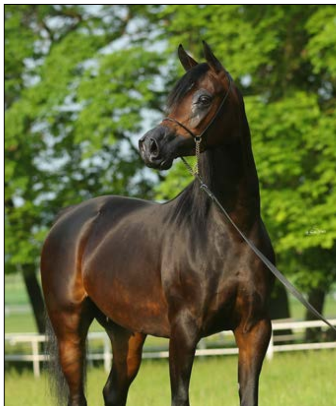
Pesalina (El Omari - Parmania / Kahil Al Shaqab) Sylwia Itenda