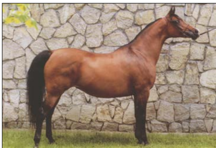
Zemsta (Arbil - Zula / Probat) Stuart Vesty