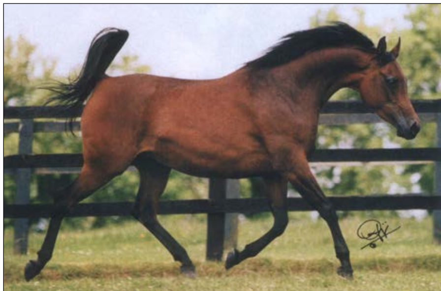
Albula (Fawor - Algeria / Celebes) Gigi Grasso

before she was exported to the USA and two of them, the bay ALWERNIA 1974 (by Celebes) and the grey ALBANIA 1976 (by Gwarny) as well as their descendants, were mostly predisposed for racing and endurance. On the contrary, the 1975 grey ALEJA (by Bandos) did not race at all but she produced the beautiful bay ALEJKA 1985 (by Palas), 1993