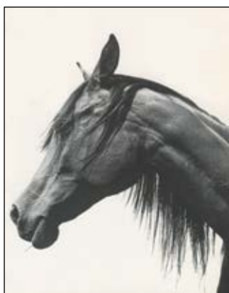
Algonkina (Pietuszk - Alga / Witraż) Zofia Raczkowska