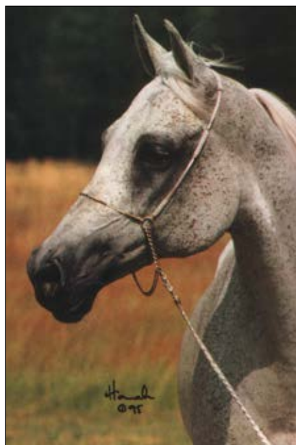
Pilawa (Burkan - Platyna / Czardasz)