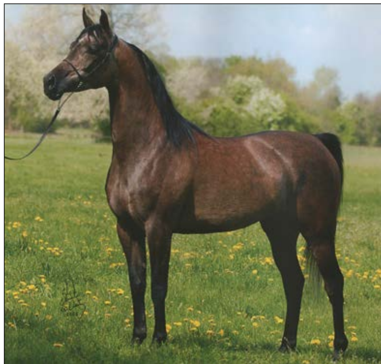
Amba (Eukaliptus - Albigowa / Fawor) Stuart Vesty