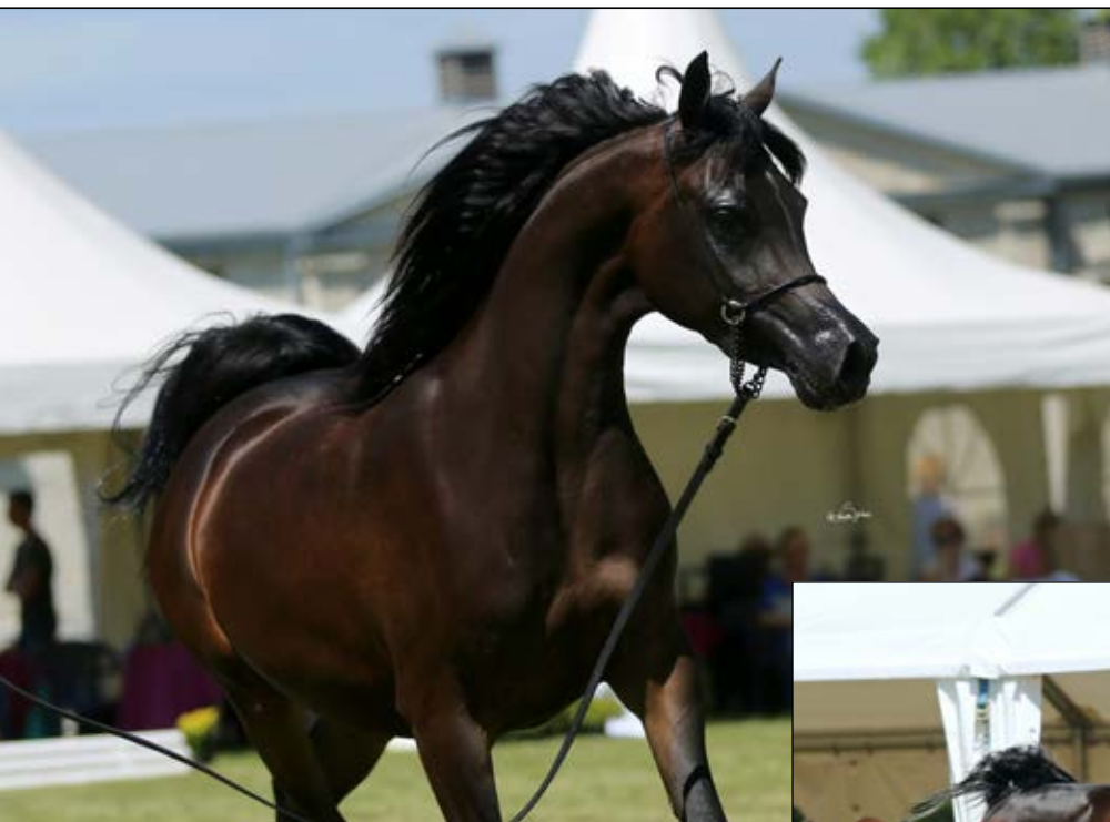
Al Jazeera (Kahil Al Shaqab - Alhasa / Ganges) Sylwia Itenda