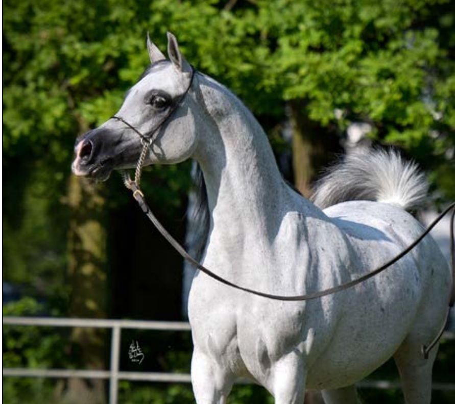
Alhambra (Ecaho - Albigowa / Fawor)

The only daughter of ALBIGOWA and Polish National Champion Stallion