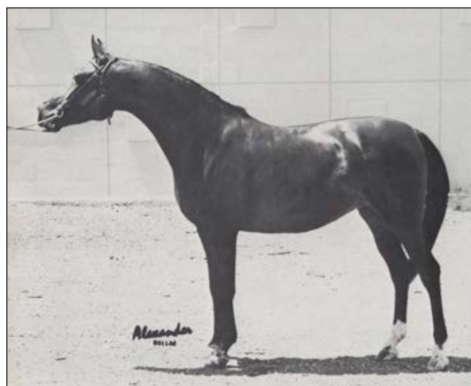
Boltonka (Arax x Bulgotka / Witraż) Alexander

where he sired 154 foals of which 80 mares and 32 stallions were used for breeding in Poland and abroad. Apart from leaving the invaluable legacy in the form of many exceptional broodmares and a few classic stakes winners, PROBAT sired some show ring superstars like European and World Champion Senior Stallion PIRUET 1983 (out of Pieczęć / Palas),